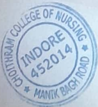
Principal Choithram College of Nursing Manik Bagh Road, Indore-452014 (M.P.) India

Our college holds permanent affiliation with DAVV, subsequently transitioning to Madhya Pradesh Medical Science University, Jabalpur.