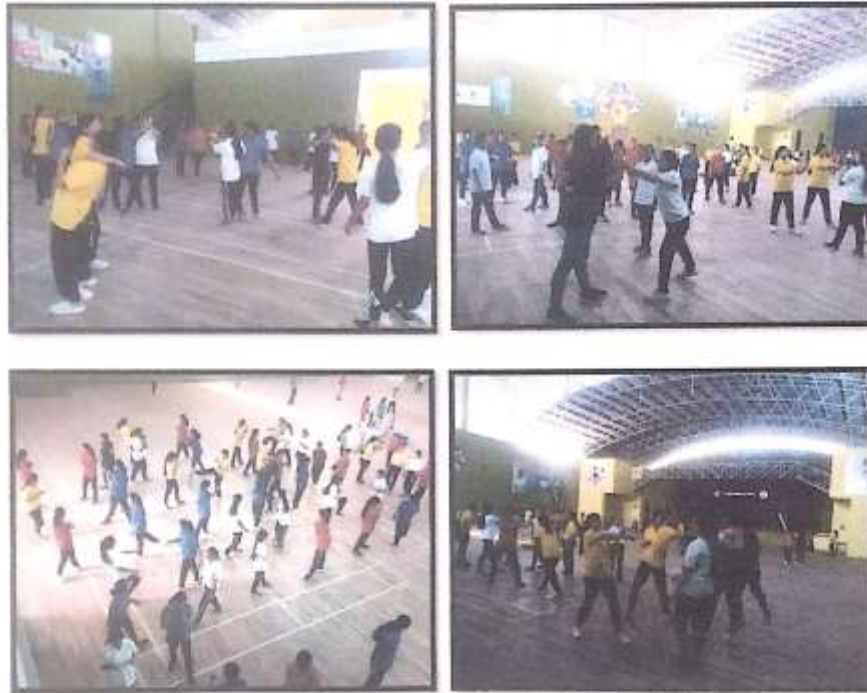
SELF-DEFENCE TRAINING SESSION

E-mail : cconursing@yahoo.co.in, choithramoffice@gmail.com Webiste : www.choithramnursing.com