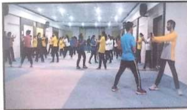
SELF DEFENCE TRAINING SESSION