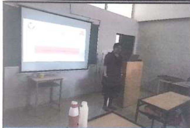
EMPOWERING WOMEN FOR PERSONAL SAFETY