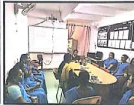
Commencement of Session by the Expert