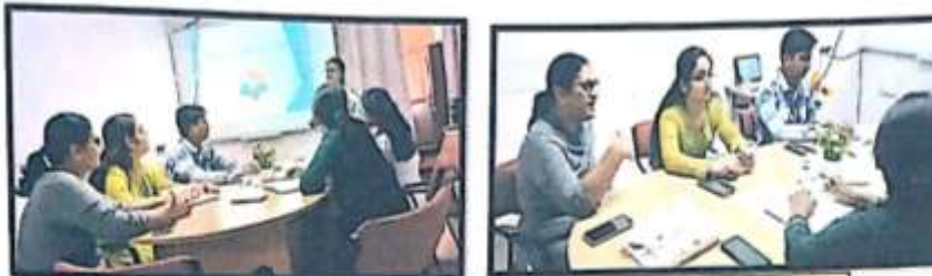
Sharing Ideas and Personal Experiences

Attendees engaged in discussions on various ethical dilemmas commonly encountered in their roles, gaining insights on how to navigate such situations with integrity and moral courage. The event facilitated an interactive platform for attendees to share their experiences, challenges, and perspectives on professional ethics and integrity. This exchange of ideas fostered a deeper understanding of the subject matter and encouraged collaborative problem-solving.