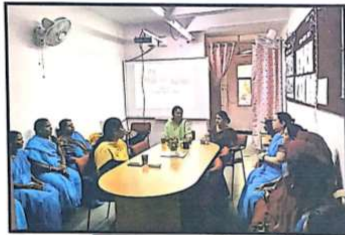
Overview About the Session

In any educational institution, the backbone of operations extends beyond the faculty and administration to encompass Supporting Staff. These individuals, often working behind the scenes, play a pivotal role in ensuring the smooth functioning of the institute. However, their significance extends beyond mere logistical support; they contribute significantly to the ethical fabric of the institution. Workplace ethics, therefore, are not solely the responsibility of administrators and educators but are equally pertinent to Supporting Staff.