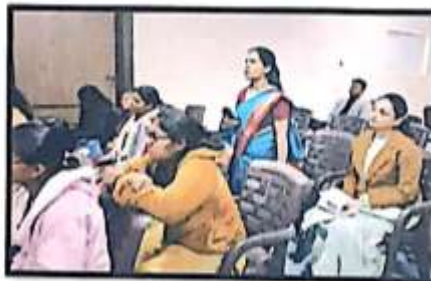
Doubt Clearance Session