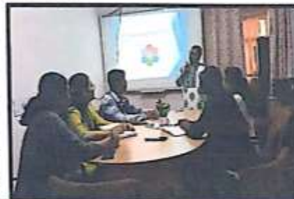
Concept Exploration With Attendees