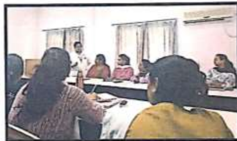
Illustration by Real world Scenarios

The expert lecture on professional conduct and ethics in nursing provided a comprehensive overview of ethical principles and practices essential for delivering high-quality patient care. Attendees gained valuable insights into maintaining professionalism, upholding ethical standards, and navigating ethical dilemmas in their nursing practice.