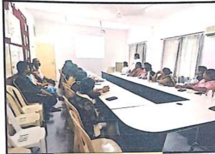
Session by Guest Speaker

E-mail : cconursing@yahoo.co.in, choithramoffice@gmail.com Webiste : www.choithramnursing.com