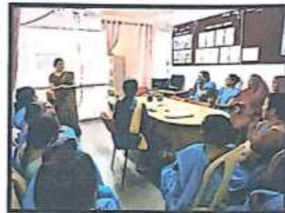
Sharing of Day-to-Day Experiences by Attendees