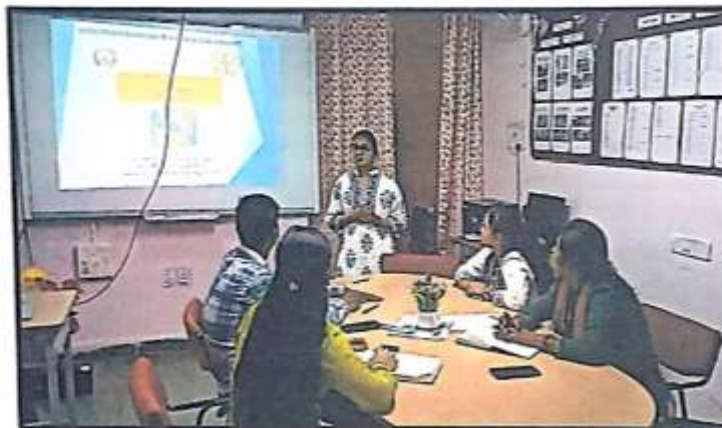
About the Session