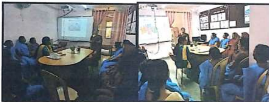
Significance of Professional Values