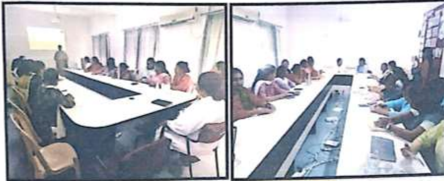
Overview of Event and Welcome of Guest Speaker

E-mail : cconursing@yahoo.co.in, choithramoffice@gmail.com Webiste : www.choithramnursing.com