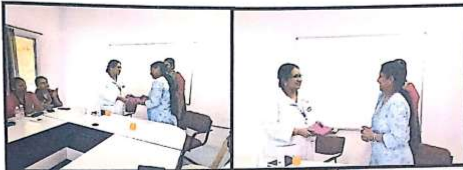
Token of Gratitude and Love

The organizers extend their gratitude to the presenter for delivering an insightful and engaging lecture on professional conduct and ethics in nursing. Special thanks are also extended to the attendees for their active participation and contributions to the discussion.