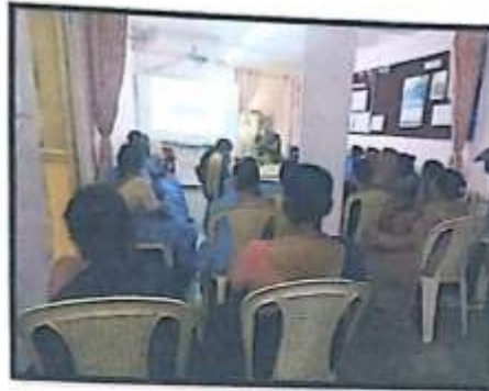
Discussion on Basics of Ethical Standard

E-mail : cconursing@yahoo.co.in, choithramoffice@gmail.com Webiste : www.choithramnursing.com