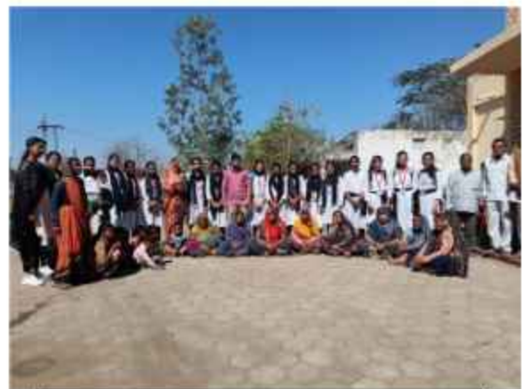
WORLD Cancer Day Feb 04 2023 Students with Beneficiaries