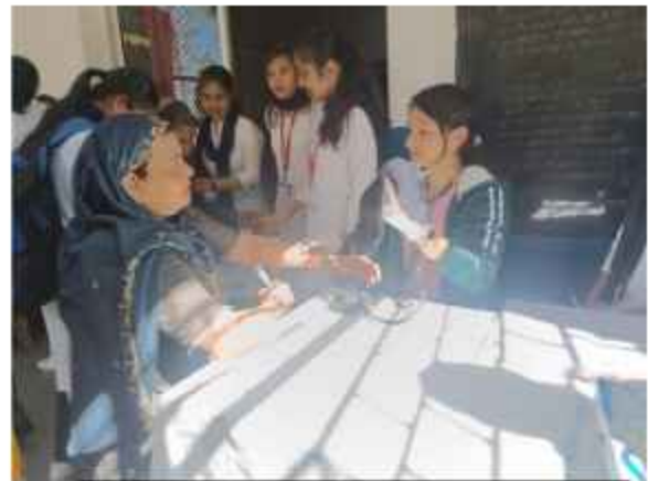
WORLD Cancer Day Feb 04 2023 Blood Pressure monitoring