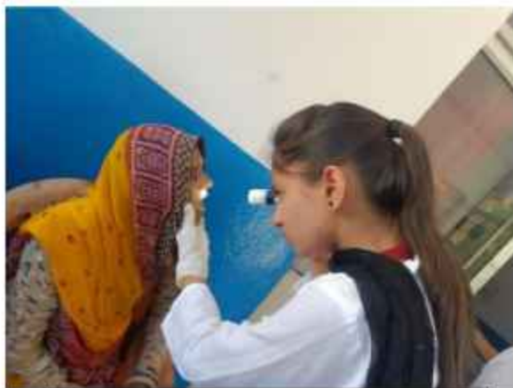
WORLD Cancer Day Feb 04 2023 Oral Examination