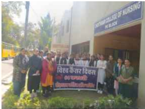
WORLD Cancer Day Feb 04 2023 Students with Faculty